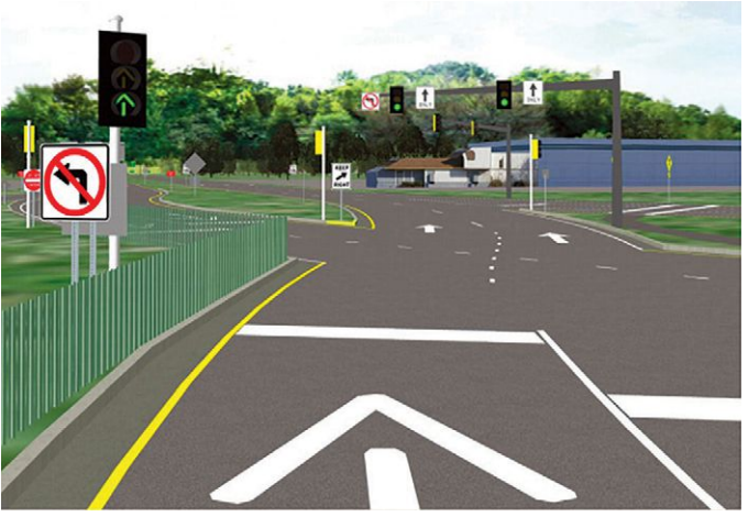
Figure 1: Visualization of Diverging Diamond Interchange.<sup>3</sup>

Despite the apparent success of "heuristic analysis," that is, analysis of what is existing and its performance, it is often critically erroneous to assume that because something has been done a